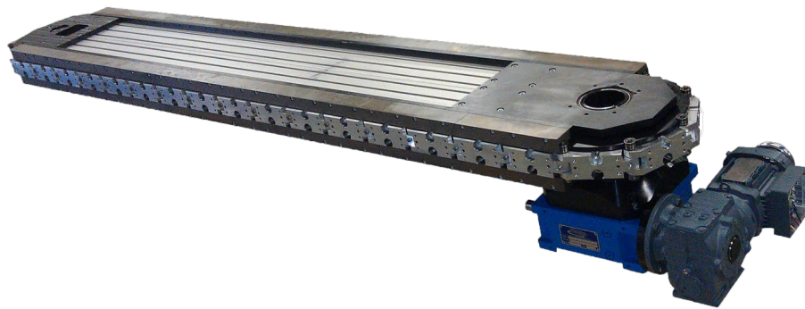
Motion Index Drives LFA100 Precision Indexing Conveyor with RTX series cam indexer

The implementation of precision link indexing conveyors in automated medical device manufacturing lines offers exceptional positioning accuracy, consistent and reliable performance, high-speed and efficient operation, seamless integration with automation systems, versatility in handling diverse assembly processes, traceability, and compliance with regulatory standards. These engineering advantages collectively enhance product quality, increase productivity, and drive efficiency in the medical device manufacturing process.