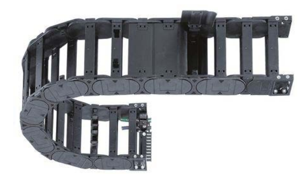
Cable Management System

At Motion Index Drives we understand the importance of getting this commonly overlooked component correctly engineered. We take the time to understand exactly what type of utilities will be passing through the cable management system. When we know exactly from the customer what type of utilities will be carried by the cable management system, we engineer and design the system to have the proper bend radius and spacing requirements. By properly designing the cable management system with the proper bend radius, maximizes the life of the utility lines. Premature breakdown of the utility lines passing through the cable management system can cause many hours of downtime. We take every precaution we can to make sure we engineer the right system.