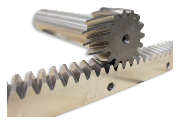
Rack and Pinnion System

When determining the proper linear transfer system there are some key factors that will help determine what is appropriate for your specific application.